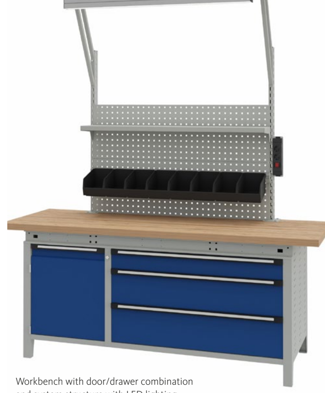
and system structure with LED lighting